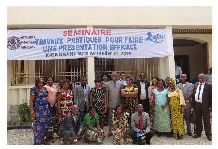
Above: WFD organised a training workshop for women in Province Oriental, DRC.