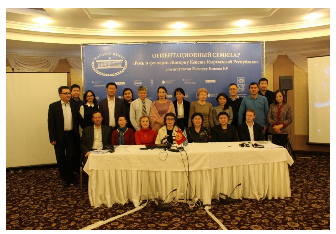
Above: WFD supported induction training in Kyrgyzstan to help parliamentarians with their important new roles.