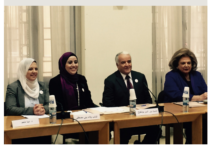
Above: WFD supported the Coalition of Arab Women MP's seminar on combatting violence against women

Since 1992 WFD has worked to support and encourage the development of pluralistic democratic practice and political institutions around the world. Parliamentary strengthening constitutes a central component of this work. This policy paper draws on the body of practice that WFD has developed over time, as evidenced by internal programme reports and external evaluations, and as elaborated by key staff in interviews. It relies primarily on the experience that WFD accumulated between 2012 and 2015, a period in which WFD delivered eleven core parliamentary strengthening programmes across countries in Europe, Asia, Africa and the Middle East. This included programmes operating at the regional, national and sub-national level. While all of these programmes built on WFD's existing relationships and experience, they also represented a break from the past. In 2012 the way in which WFD is funded changed significantly, with both the Department for International Development and the Foreign & Commonwealth Office committing to 3 year grants. That shift led WFD to adopt a longer-term approach to programme design and implementation.