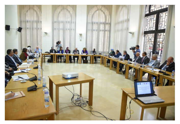
Above: WFD supported the Coalition of Arab Women MP's seminar on combatting violence against women

This regional programme aimed to strengthen the capacity of women MPs in MENA and to enhance the progression of legislative reforms relevant to women. One of the programme's key achievements was the formation of a coalition to combat violence against women. This coalition of women MPs and CSOs from eleven different countries has developed a model law protecting women against violence and worked to draw attention to genderbased violence in a number of other ways. It has proved difficult to translate the work of the regional coalition into specific, legislative reforms at the national level. However, the attention it has drawn to the issue of violence against women is significant in a region where that topic is particularly sensitive, often viewed as a matter that should be confined to the private sphere rather than subject to public debate.