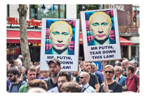
Support for LGBTI rights has been used to discredit civil society groups in several countries, including Russia and Uganda.