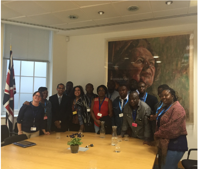
Africa Liberal Network 2015 visits Liberal Democrat Party Conference